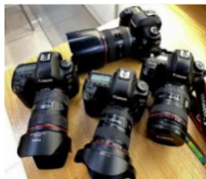
; `^`kXcgif [ I Zkj