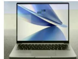
E f k \ Y f f b