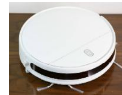
? f d \ ` X I k f d X k f e